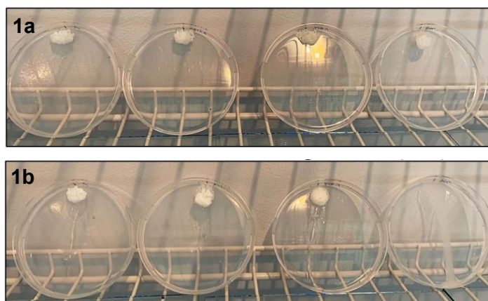
Figures 1a and 1b. The leakage test (randomly selected agar plates) for PCCA Ellage, PCCA formulas 13845 and 13834, and the OTC long-lasting vaginal moisturizer: undiluted formulas (1a) and diluted formulas (1b).

PCCA Ellage Estriol 0.1% Testosterone 0.1% in Ellage Amitriptyline 2% Baclofen 2% in Ellage OTC Long- Lasting Vaginal Moisturizer