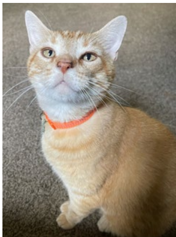
Figure 1. Photo of Ginger, a happy cat, 1 week after treatment.

We would like to share our 'Happy Cat' story with PCCA and other pharmacies.